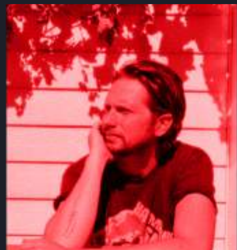
AUREL BELGIUM POP

Hello, this is Loverman, here to tell you a long story short. It begins with a sequence of the inevitable followed by more of the inevitable (if you know, you know) which set in motion a journey for something true. A journey starting at the place where all truth finds its bearings, the blessed and bloody capacity for love in each-and-every human being. Throughout this journey, haunted by my love and hate for the hardcore continuum (Burial), for my homeland (Belgian Brit/British Belgian), modern day troubadours (Brel/Walker/Cohen), and the abstractions uniting all of the above (The Singing Detective), I wrote love songs on an old guitar. They tell you a new story you've all heard before but still need to hear. Stripped down to their bare necessities, these love songs recollect and reload. Written and recorded on a rooftop somewhere in Belgium.