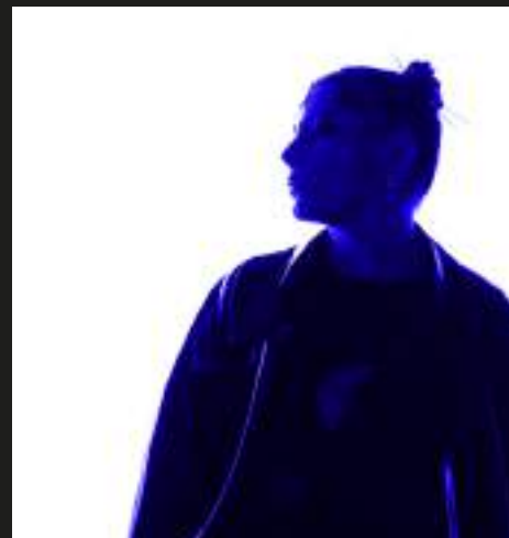
AMOÜË CROSSROADS' PARTNERSHIP FRENCH POP

Laventure's taste for the homemade is pronounced, the parties or defeats share charms as well as disappointments, and the canines reign.