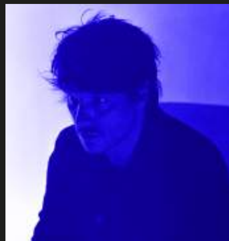
THEM LIGHTS LUXEMBOURG SOUL RNB ELECTRONICA

Like the soundtrack to a summer that must never end, the dreamy indie dreamy indie romances by Willow Parlo wash over the life of the soul. No matter how hopeless the everyday melancholy may seem - the Hamburg-based band pushes the grey clouds aside and lets light into the soul. In a symbiosis of alternative indie pop, two-dimensional and dreamy soundscapes, echoes of coming-of-age and American rock music, Willow Parlo tells of farewells and new beginnings. of goodbyes and new beginnings, breaks up and breaks out, leaving a lasting impression. At the same time, the band retains its hopeful vibe. This flows in warm waves with melodious harmonies, carrying and approachable vocals. The burden of postmodern life disappears in their sound, but it always remains certain that after every descent will be followed by the next ascent to the summit.