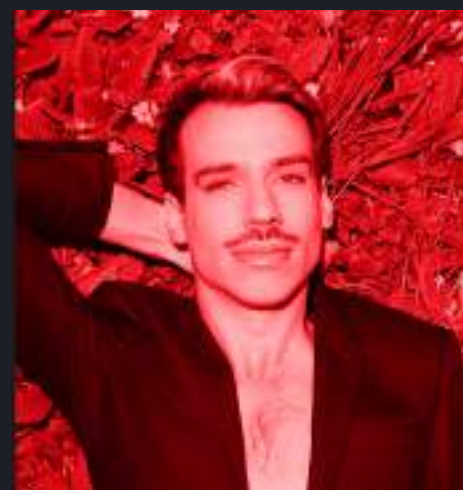
CLÉMENT VISAGE GRAND EAST REGION ELECTRONIC POP

Abacadabra K7 is a LOFI album made around a guitar, a rhythm box and a piano.