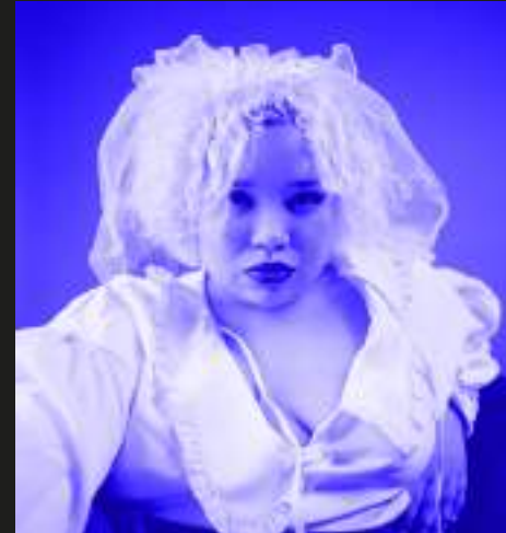
LAVENTURE GRAND EAST REGION POP ROCK LOFI

Las Baklavas is a group of 6 committed musicians who draw their inspiration from the sounds of the Balkans and Latin America. These colours, combined with the pop feminism of their compositions, blend to create a texture where traditional and contemporary music coexist. On stage, a singular space-time fuses acoustic and electronic instruments, raps, polyphonies and jazz or techno influences. By reinterpreting tradition, Las Baklavas redistribute the creative and powerful energy of the feminine principle and re-establish the truth contained in the original texts, moving from a passive representation to a claimed liberation and political identity. All united in a lively, festive energy, they invite the audience to question their own empowerment and to immerse themselves in this warm, collective atmosphere.