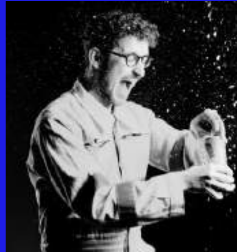
BOBINE GRAND EAST REGION ELECTRAPP

Spearheading the electrapp movement, Bobine's unique style is the perfect feat between Orelsan and Salut c'est Cool. Bobine's self-deprecating lyrics and explosive prods make for a colourful show that's fun to listen to, watch and experience. A single phrase serves as a watchword: "get your best moves ready, it's going to bounce!"