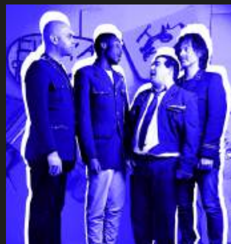
CHEVALIER SURPRISE BELGIUM BOOGIE PUNK ROCK

Formed in Reims in 2016, Protogonos draw their influences from the essence of the Metalcore scene such as As I Lay Dying, Miss May I, Bring Me the Horizon and The Devil Wears Prada. The band's sound is energetic, powerful and progressive, while their repertoire is richly melodic, with brutal vocals borrowed from the Death genre alternating with clean vocals to enhance the melodic contrast.