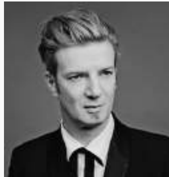
BERTRAND BELIN / BERTRAND BELIN