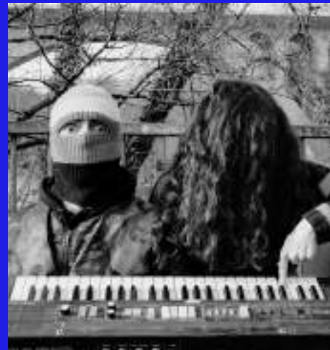
BOUND BY ENDOGAMY SWITZERLAND ALTERNATIVE INDIE MUSIC

Spearheading the electrapp movement, Bobine's unique style is the perfect feat between Orelsan and Salut c'est Cool. Bobine's self-deprecating lyrics and explosive prods make for a colourful show that's fun to listen to, watch and experience. A single phrase serves as a watchword: "get your best moves ready, it's going to bounce!"