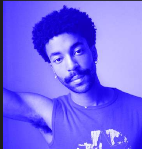
ZEDIE BELGIUM POP