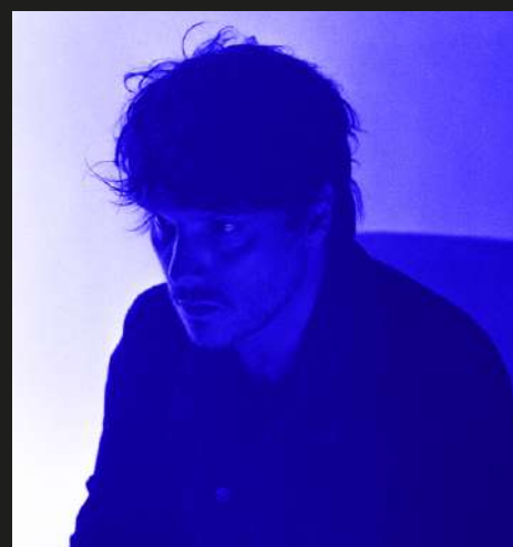
THEM LIGHTS LUXEMBOURG SOUL RNB ELECTRONICA

Like the soundtrack to a summer that must never end, the dreamy indie dreamy indie romances by Willow Parlo wash over the life of the soul. No matter how hopeless the everyday melancholy may seem - the Hamburg-based band pushes the grey clouds aside and lets light into the soul. In a symbiosis of alternative indie pop, two-dimensional and dreamy soundscapes, echoes of coming-of-age and American rock music, Willow Parlo tells of farewells and new beginnings. of goodbyes and new beginnings, breaks up and breaks out, leaving a lasting impression. At the same time, the band retains its hopeful vibe. This flows in warm waves with melodious harmonies, carrying and approachable vocals. The burden of postmodern life disappears in their sound, but it always remains certain that after every descent will be followed by the next ascent to the summit.