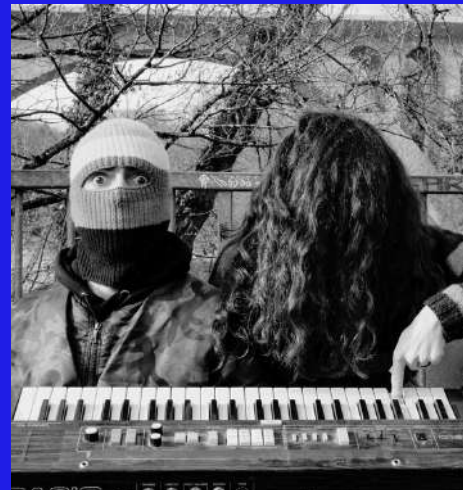
BOUND BY ENDOGAMY SWITZERLAND ALTERNATIVE INDIE MUSIC

Spearheading the electrapp movement, Bobine's unique style is the perfect feat between Orelsan and Salut c'est Cool. Bobine's self-deprecating lyrics and explosive prods make for a colourful show that's fun to listen to, watch and experience. A single phrase serves as a watchword: "get your best moves ready, it's going to bounce!"