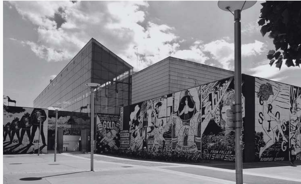
Auditorium du MAMCS 1 Place Hans-Jean-Arp 67000 Strasbourg