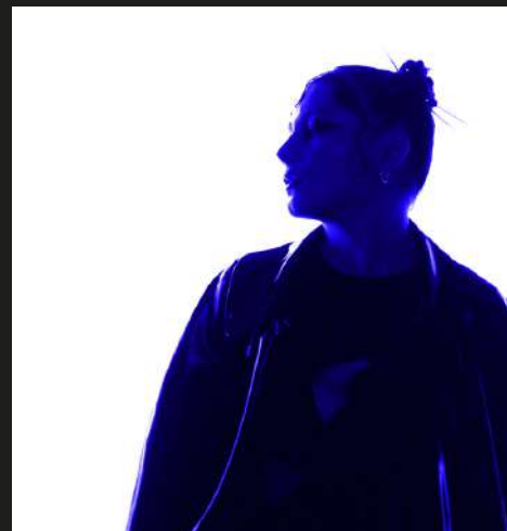
AMOÜË CROSSROADS' PARTNERSHIP FRENCH POP

Laventure's taste for the homemade is pronounced, the parties or defeats share charms as well as disappointments, and the canines reign.