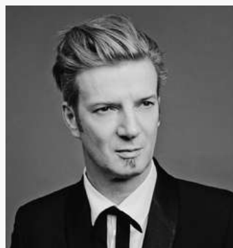
BERTRAND BELIN / BERTRAND BELIN