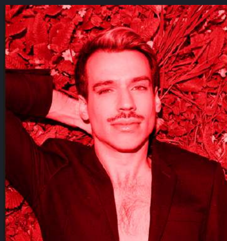
CLÉMENT VISAGE GRAND EAST REGION ELECTRONIC POP

Abacadabra K7 is a LOFI album made around a guitar, a rhythm box and a piano.