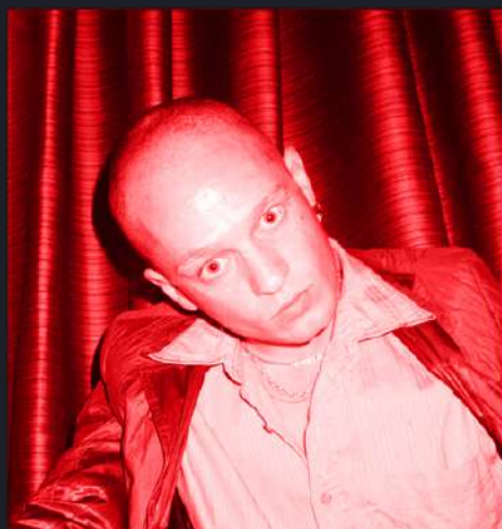
LOVERMAN BELGIUM FOLK

Hello, this is Loverman, here to tell you a long story short. It begins with a sequence of the inevitable followed by more of the inevitable (if you know, you know) which set in motion a journey for something true. A journey starting at the place where all truth finds its bearings, the blessed and bloody capacity for love in each-and-every human being.