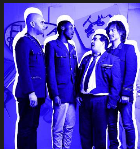
CHEVALIER SURPRISE BELGIUM BOOGIE PUNK ROCK

Formed in Reims in 2016, Protogonos draw their influences from the essence of the Metalcore scene such as As I Lay Dying, Miss May I, Bring Me the Horizon and The Devil Wears Prada. The band's sound is energetic, powerful and progressive, while their repertoire is richly melodic, with brutal vocals borrowed from the Death genre alternating with clean vocals to enhance the melodic contrast.