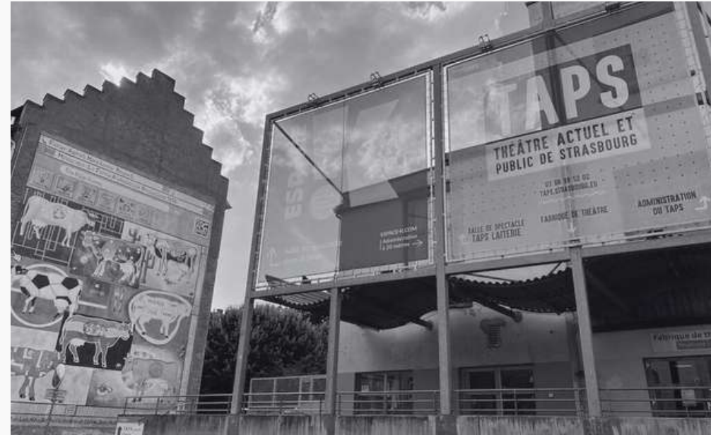
Salle des Colonnes 10 rue du Hohwald 67000 Strasbourg