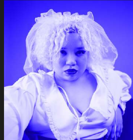
LAVENTURE GRAND EAST REGION POP ROCK LOFI

Las Baklavas is a group of 6 committed musicians who draw their inspiration from the sounds of the Balkans and Latin America. These colours, combined with the pop feminism of their compositions, blend to create a texture where traditional and contemporary music coexist. On stage, a singular space-time fuses acoustic and electronic instruments, raps, polyphonies and jazz or techno influences. By reinterpreting tradition, Las Baklavas redistribute the creative and powerful energy of the feminine principle and re-establish the truth contained in the original texts, moving from a passive representation to a claimed liberation and political identity. All united in a lively, festive energy, they invite the audience to question their own empowerment and to immerse themselves in this warm, collective atmosphere.