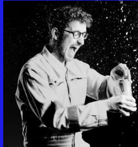
BOBINE GRAND EAST REGION ELECTRAPP

Spearheading the electrapp movement, Bobine's unique style is the perfect feat between Orelsan and Salut c'est Cool. Bobine's self-deprecating lyrics and explosive prods make for a colourful show that's fun to listen to, watch and experience. A single phrase serves as a watchword: "get your best moves ready, it's going to bounce!"